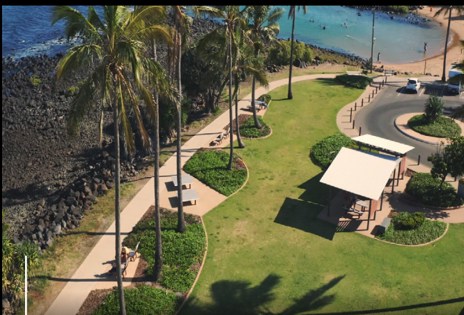
This is Grillex

Our aim is to attract and retain the most driven, passionate and qualified person for the job. Our team is made up of customer-centric people who believe in lifelong learning and constant innovation.