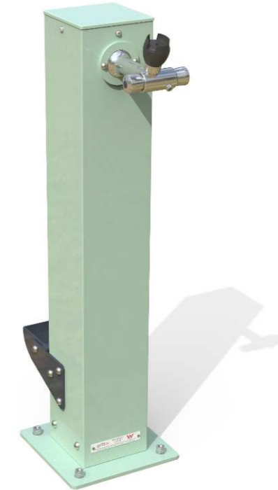
PICTORIAL FRONT VIEW Nominal Water Flow: 2L / Min