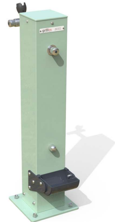
PICTORIAL REAR VIEW